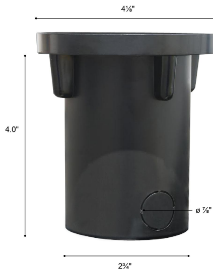
Concrete Pour Box (CPX)

Lumux reserves the right to modify the above details to reflect changes in the cost of materials and/or design without prior notice.